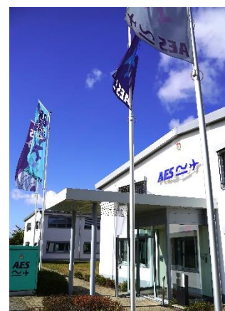
AES headquarters in the airport city Bremen.

E-Mail: info@aes-aero.com Website: www.aes-aero.com