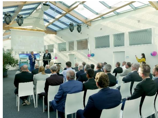
Technical lectures by renowned aviation experts at AES to mark the 25th anniversary.

In recent years, AES GmbH has positioned itself towards the future, which has allowed them to manage the Corona crisis using their Hanseatic entrepreneurial skills and a strong team effort from their employees. Accordingly, they have developed series products out of research projects using gesture control to avoid contact surfaces, and wireless data transmission via light, these products being currently in use by their customers.